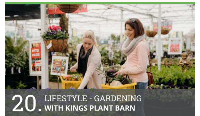
20. LIFESTYLE - GARDENING WITH KINGS PLANT BARN