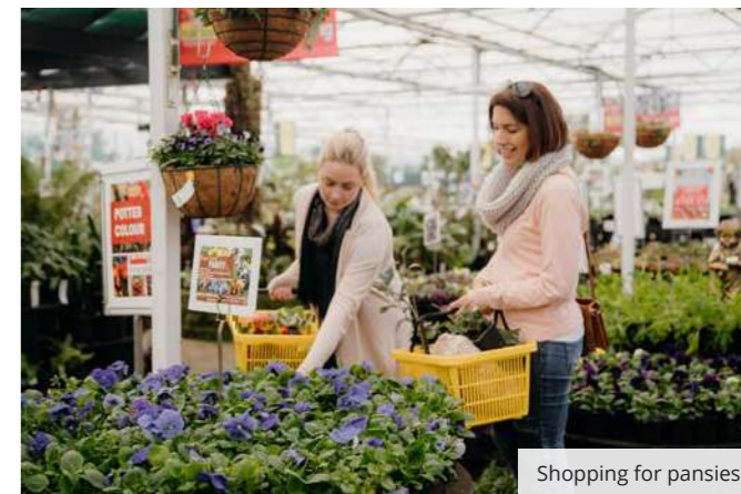
Shopping for pansies