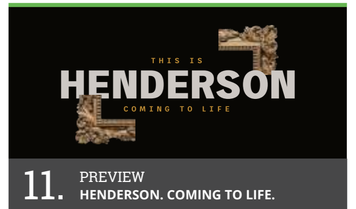
11. PREVIEW HENDERSON. COMING TO LIFE.