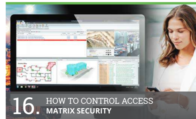
16. HOW TO CONTROL ACCESS MATRIX SECURITY